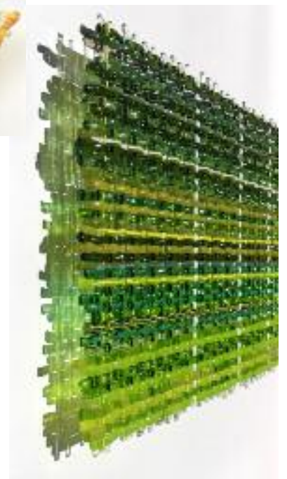
Love’s glass-woven sculptures can each take the artist upwards of 50 hours