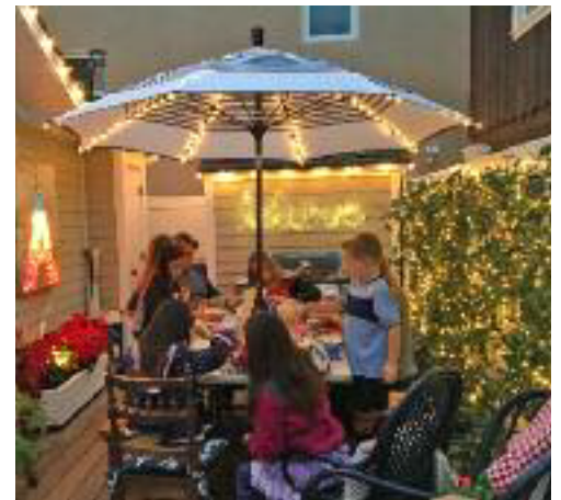
Grandchildren making gingerbread houses next to the jasmine vine's lights.