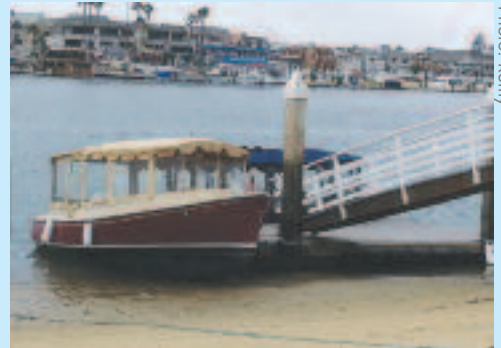
Boats on docks and shore moorings around Balboa Island suffer the same fate at low tide without dredging...no boating today!

Terry Janssen and I will be meeting with the City to discuss next year's goals. Some of the items on our list are street