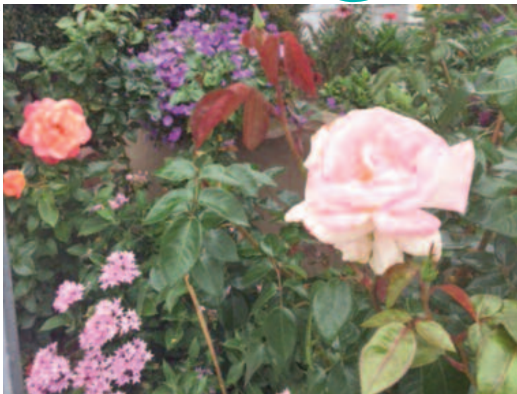
Pink Cancer Rose (benefits breast cancer research).