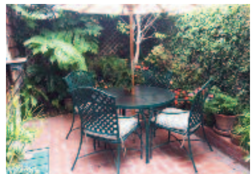
The shaded, private patio surrounded by various trees

What a beautiful, peaceful cottage. What nice people. What a little slice of Europe just steps away.... Well done, Mark and Jane!