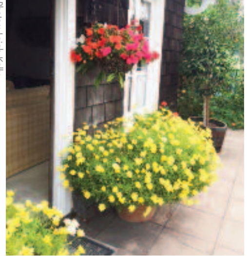
Marguerite bushes and a basket of impatiens by the front door.

back against the hedge that encloses their patio. Nasturtiums grow in abundance under a side birch tree.