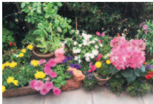
Flowers of all varieties--all in containers