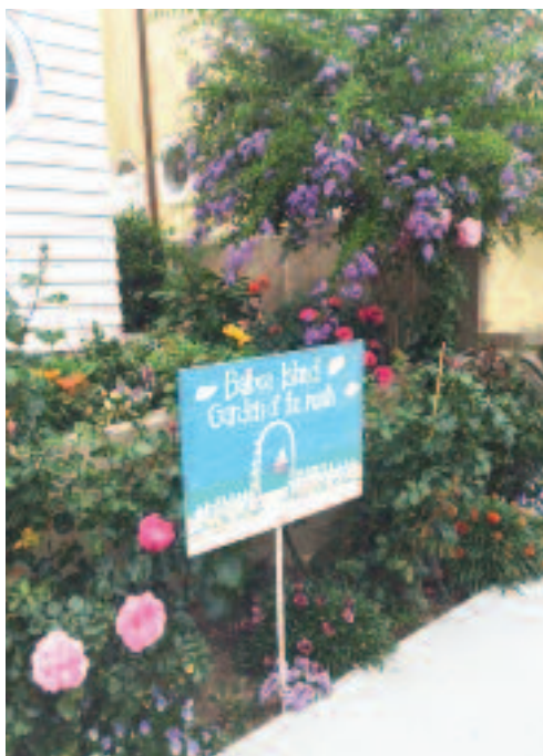
Winner sign among the roses and Duranta Tree

Flowers of all different colors and varieties grow under, around, and behind the roses. Mexican heather, salvia, alyssum, redbecca, violas, and Black-eyed Susans are in full bloom amidst small bushes with variegated leaves. The front patio was poured with two-inch gaps between slabs and that gap is planted with a perfect little variegated grass. Sue keeps it perfect...down to a flower poking its head up here and there. At the edge of the patio is a blooming Duranta Tree.