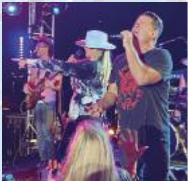
Reflexx will rock the Fun Zone