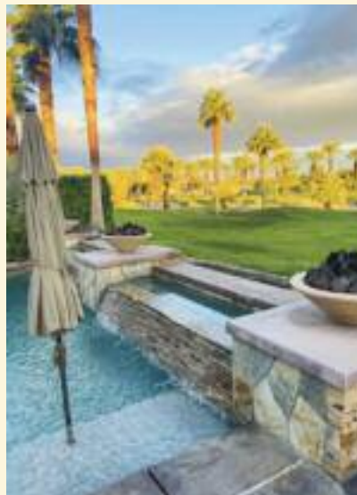
Desert getaway in La Quinta - FORE!