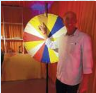
Carnival-inspired games & prizes