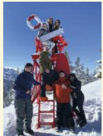
Frinzi Snow Day - Aspen, Colorado