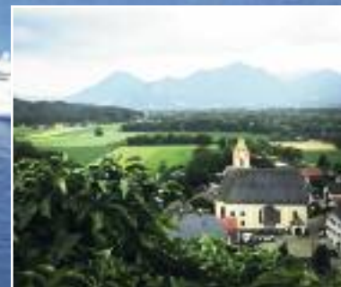
Bad Aibling, Germany