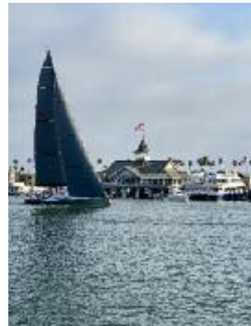
Ho hum, another beautiful sight