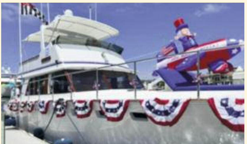
"FIRST LIGHT", a 51' wooden Stephen's, originally made for legendary guitar maker, Leo Fender in 1974, the last one built, decked out for the American Legion Boat Parade