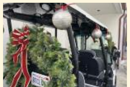
Balboa Island holiday hayride