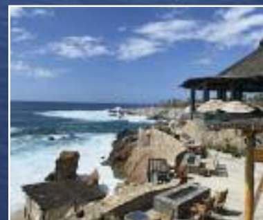
Cabo San Lucas