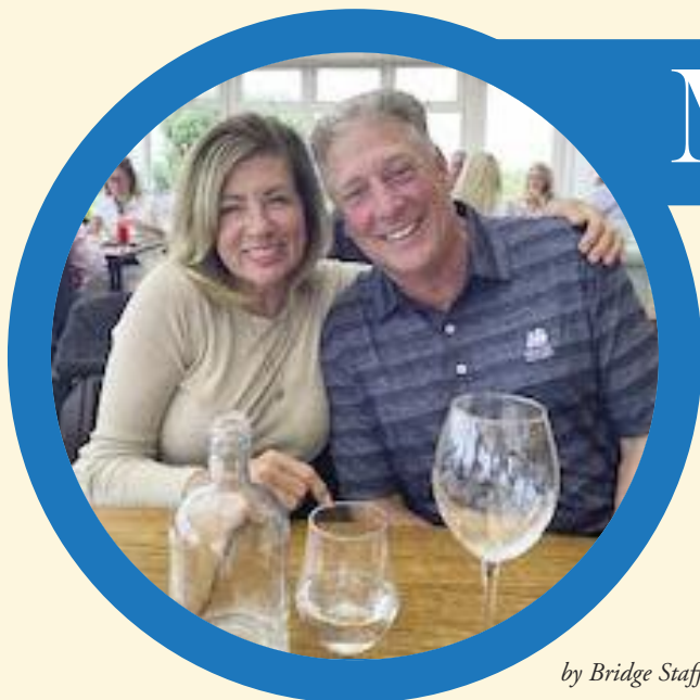
by Bridge Staff