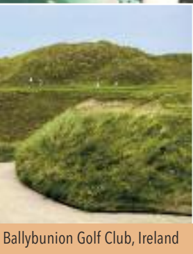
Ballybunion Golf Club, Ireland