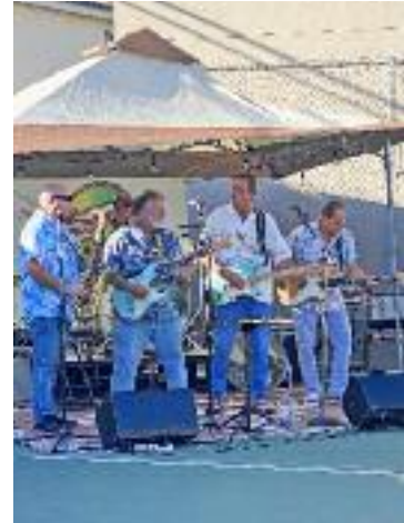
The Nomads at one of the six Concerts in the Park this summer