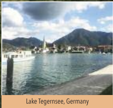
Lake Tegernsee, Germany