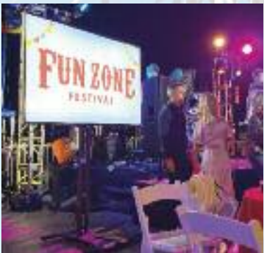
Amazing venue on the bay, exciting band, great food and drink!