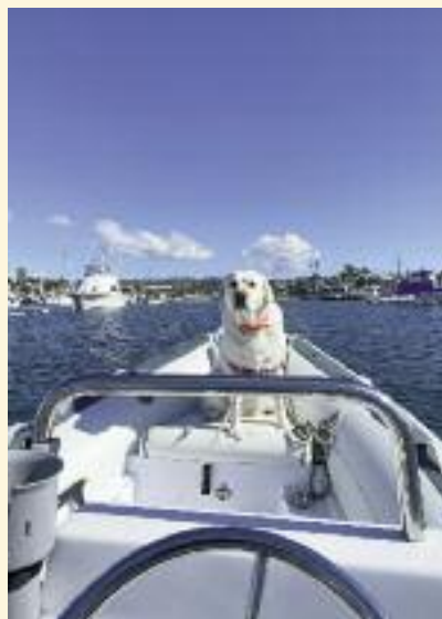
Captain Luna barking out commands