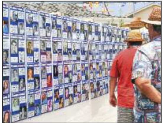
100 years of Commodores on display