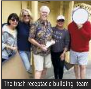
The trash receptacle building team