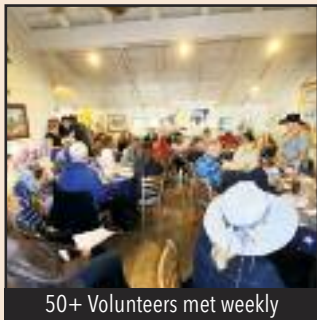
50+ Volunteers met weekly