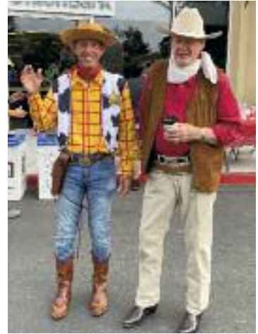
Woody and The Duke cross paths