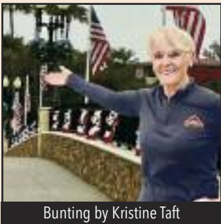
Bunting by Kristine Taft