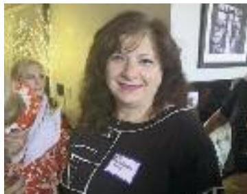
Rose of Alex's Fashion Center, one of the oldest businesses on the Island