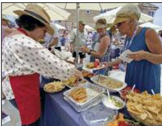
Turquoise on South Bay Front was transformed into a outdoor bistro with great food and drink