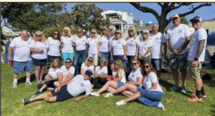
Patio Chair Drill Team, always a favorite!