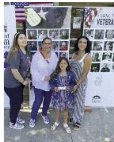
The Honor Wall was a highlight