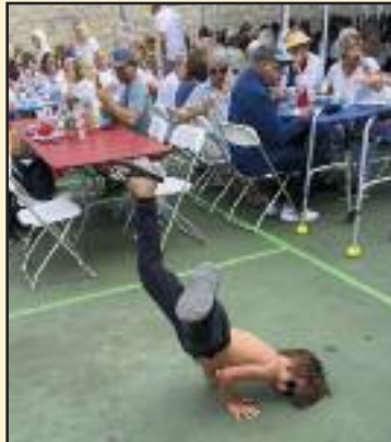
He didn't trip, he's Breakdancing