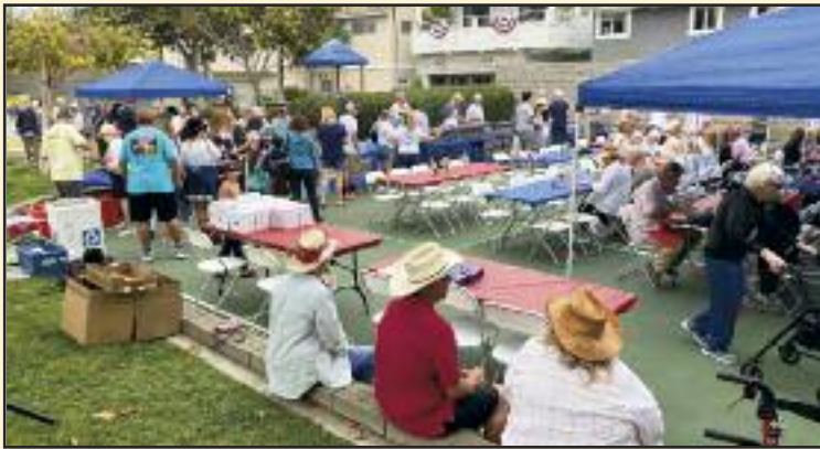
Our annual neighborhood social, the Pancake Breakfast brings Islanders together

The BIIA held it's Annual Pancake Breakfast and Parade Award Ceremony in Balboa Park on June 25th. Over 200 attended and enjoyed music, fantastic food, and getting together with their neighbors. A good time had by all!