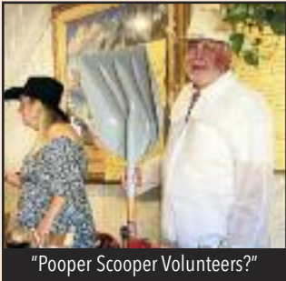
"Pooper Scooper Volunteers?"

THANK YOU to all the BIIA Parade Volunteers!