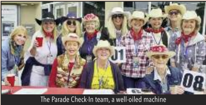
The Parade Check-In team, a well-oiled machine