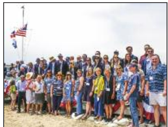
Staff Commodores and Staff Secretary Treasurers