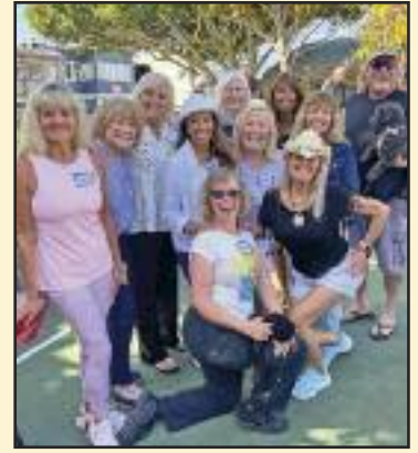
Caring Companions at Home team with cast members of the CHOC Follies