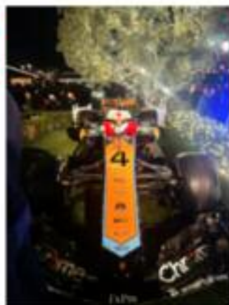
McLaren Formula 1 Racecar on display at 351 E. Bayfront

Just when we thought our island festivities could not get any better we were blessed with live reindeers and a McLaren for all to bewonder.