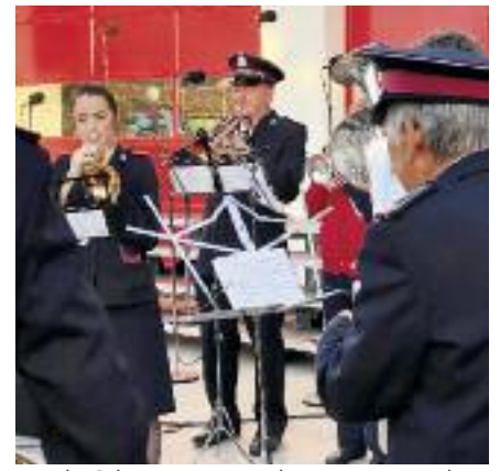
The Salvation Army Band again entertained again this year