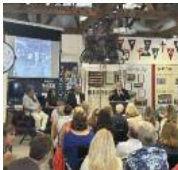
Sold out events included celebrating 75 years of the good life at Balboa Bay Club and Peter Falk's Columbo episodes shot on Newport Harbor