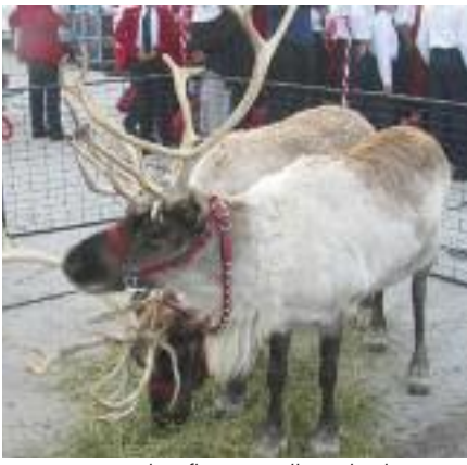
A Reindeer fly-in on Balboa Island!