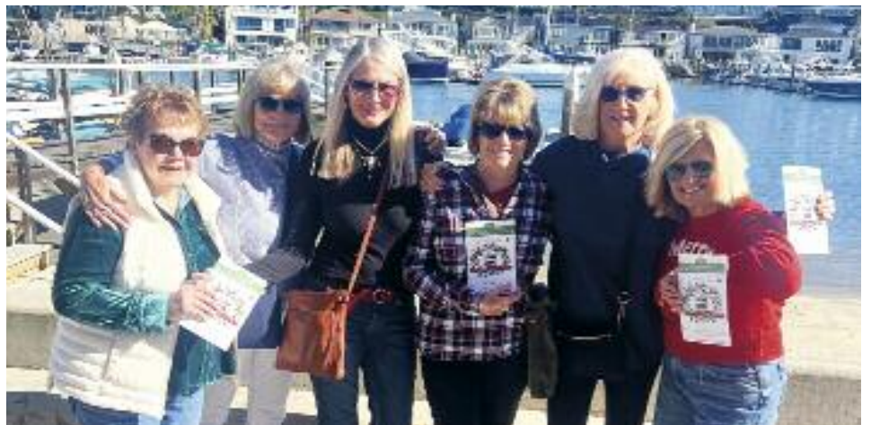
Perfect weather, good friends, and touring beautiful homes on Balboa Island...what a great day!