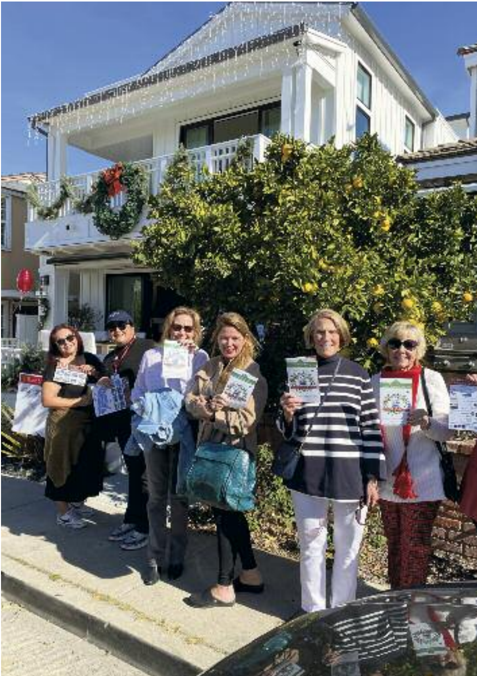
Happy Holiday Home Tour ticket holders visiting 216 Sapphire