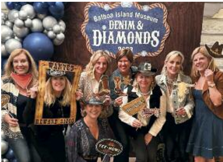
Museum supporters dusted off their boots and cowboy hats for the 3rd Annual Fun Zone Festival - Denim & Diamonds. Next year's October 18th, Save the Date!