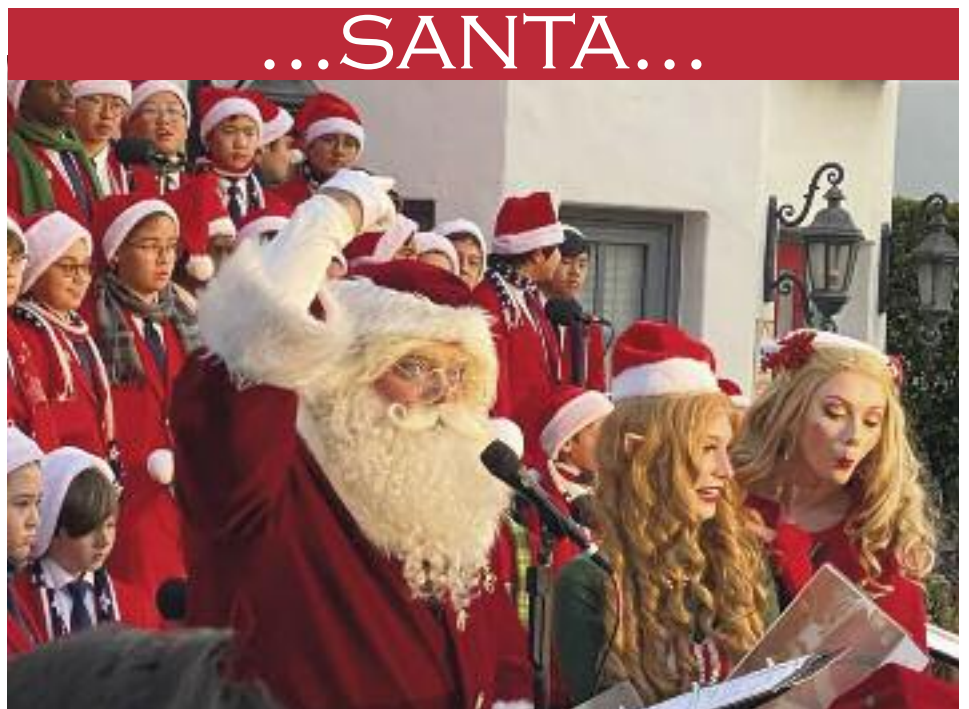
A record crowd delights in the high production value of "Twas the Night Before Christmas"