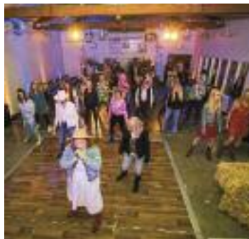
The Big Event: Annual Fun Zone Event sported Western theme in '23. Festival returns October 18th in '24