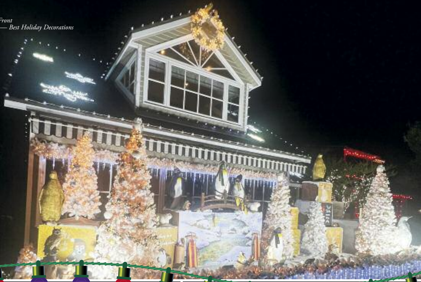
526 South Bay Front Overall Winner — Best Holiday Decorations