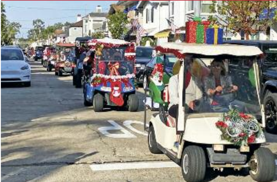
Annual Christmas Golf Cart Parade kicks off the festive day of island fun