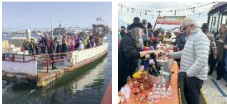
The Cinco de Mayo private ferry cruise has become a museum staple for members