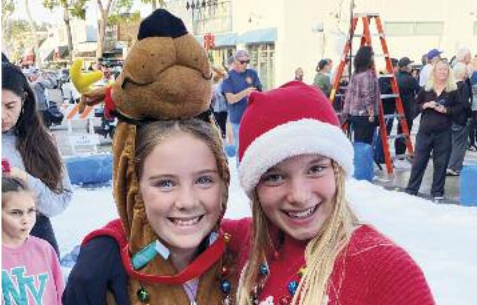
Snow Day buddies