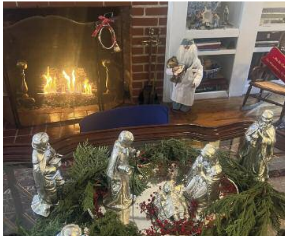
Charming cottage at 123 Apolena