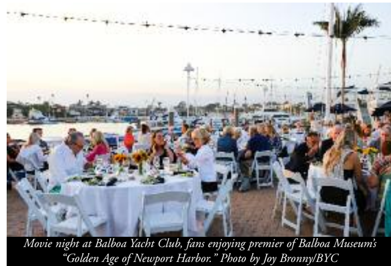
Movie night at Balboa Yacht Club, fans enjoying premier of Balboa Museum’s “Golden Age of Newport Harbor.”