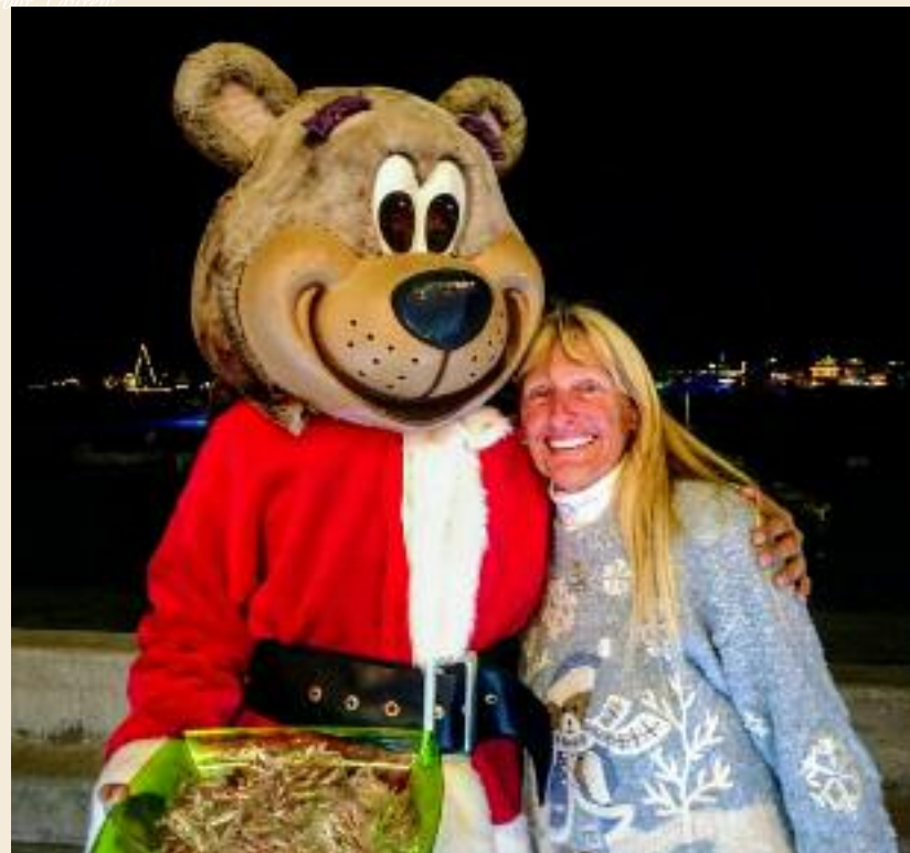
He wouldn't fit in the window, or you can bet she would have.