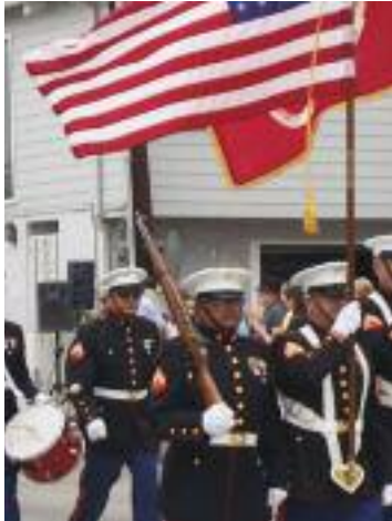
Welcome back the U.S. Marine Corp Band