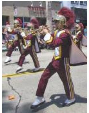
The USC Marching Band will once again thrill the crowd on Marine Ave.