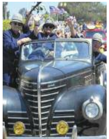
Keystone Cops on Parade Security. Hey, what could go wrong?!