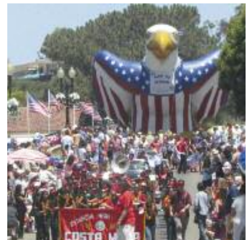
Our Annual Parade is Sunday, June 5th

Happy to call the Island home since 2017, play mediocre tennis, spoil my rescue, cocker spaniel Melania and fly back to the Swamps of Jersey to root for my beloved NY Giants.