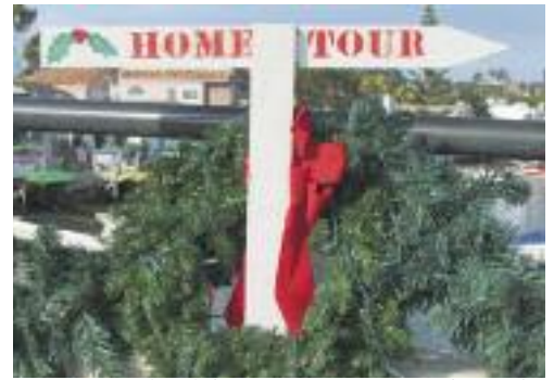
Our Annual Holiday Home Tour is December 11th