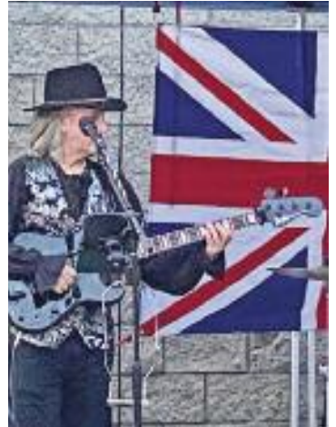
Check the calendar inside for all the BIIA events coming up in 2022